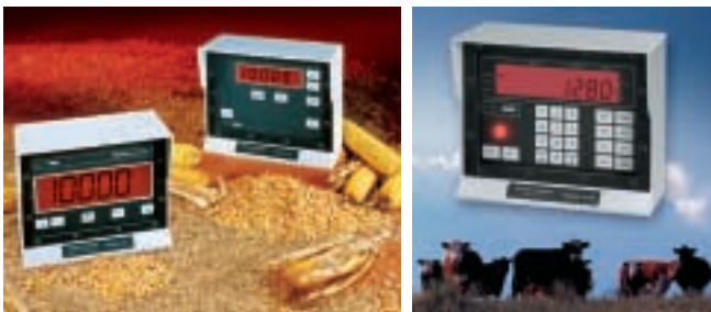
Model 615 and 615XL Indicators